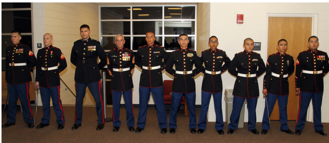
Student Marines at the 2012 Marine Corps Ball