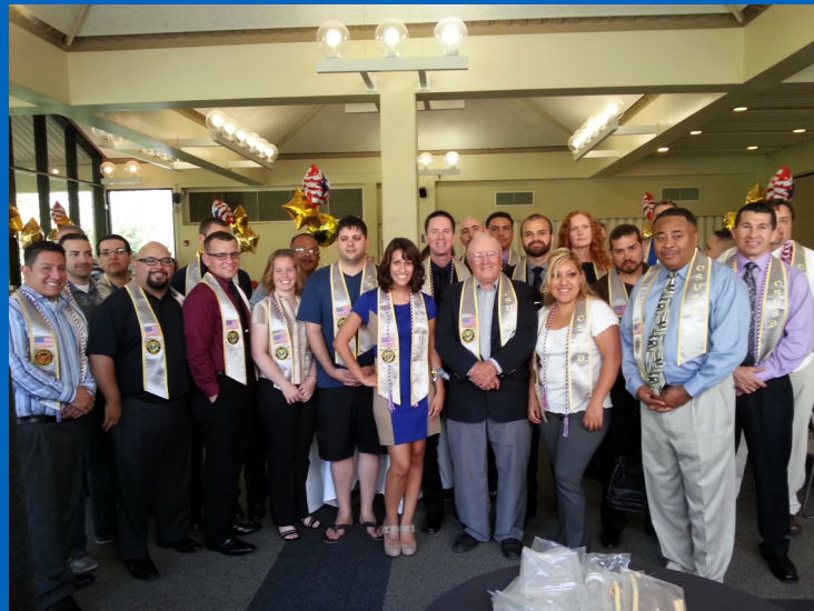
CSUSB spring 2013 graduating veterans

On Wednesday, June 5, 2013, the Veterans Success Center and Student Veterans Organization held the third Veterans Graduation Celebration. The event was not only centered on the graduates, but their support system as well including their families, friends, colleagues, staff and many others. Forty students veterans were on-hand to receive their graduation stoles adorned with the American flag, branch patch and embroidered with CSUSB. Twenty-nine graduating veterans also received honor chords and a one-year paid membership to the SALUTE National Honor Society.