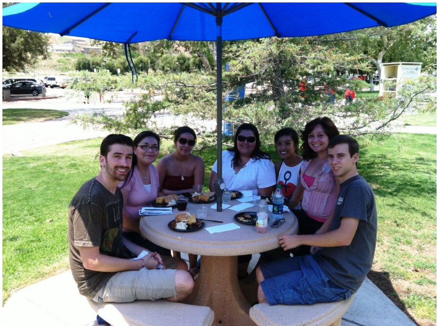
Students enjoying their lunch during the open house

We are truly honored to have the campus community join us in celebration of our nation's 237 th birthday. The 4th of July, 2013, finds our country facing many challenges and we're rising to meet them. Today and every day, we are grateful for our freedom and proud to be Americans.